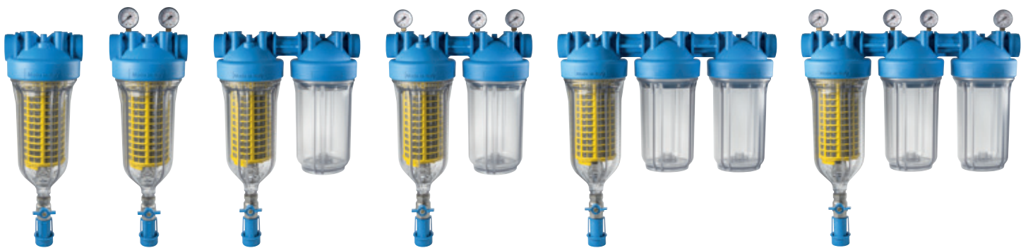
-BIG RAH- singolo stadio

Specially designed for HYDRA BIG self-cleaning filter series